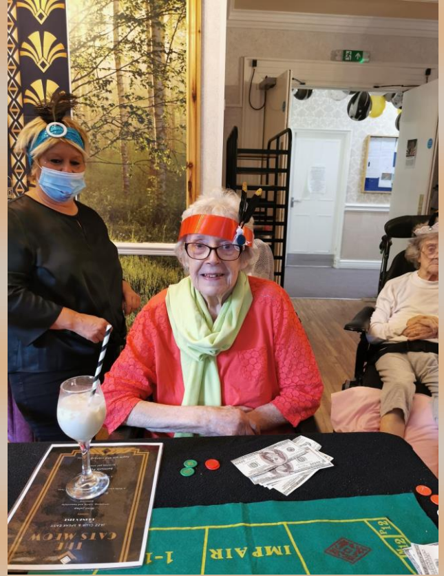
Pina Colada helps Lady Luck