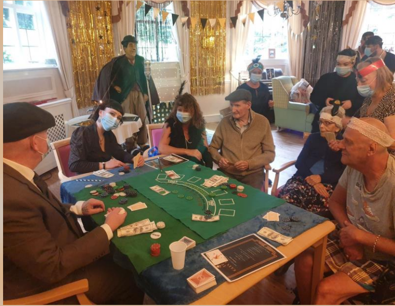
The residents and staff enjoying Blackjack unaware That someone had murder in mind.....