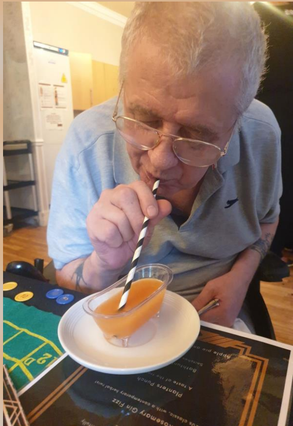
Bathing in Bath Gin